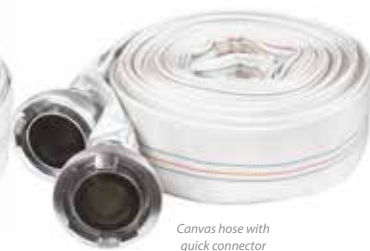
Canvas hose with quick connector